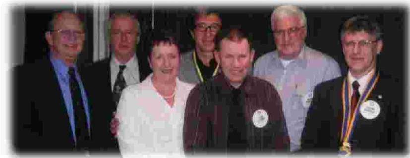
The 09-2010 Board of Directors